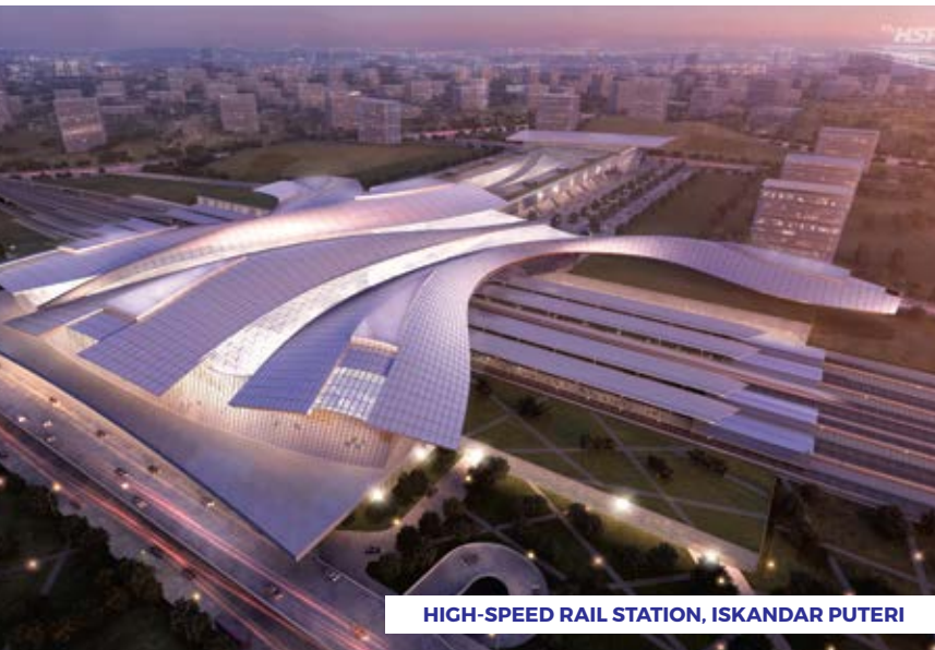
HIGH-SPEED RAIL STATION, ISKANDAR PUTERI