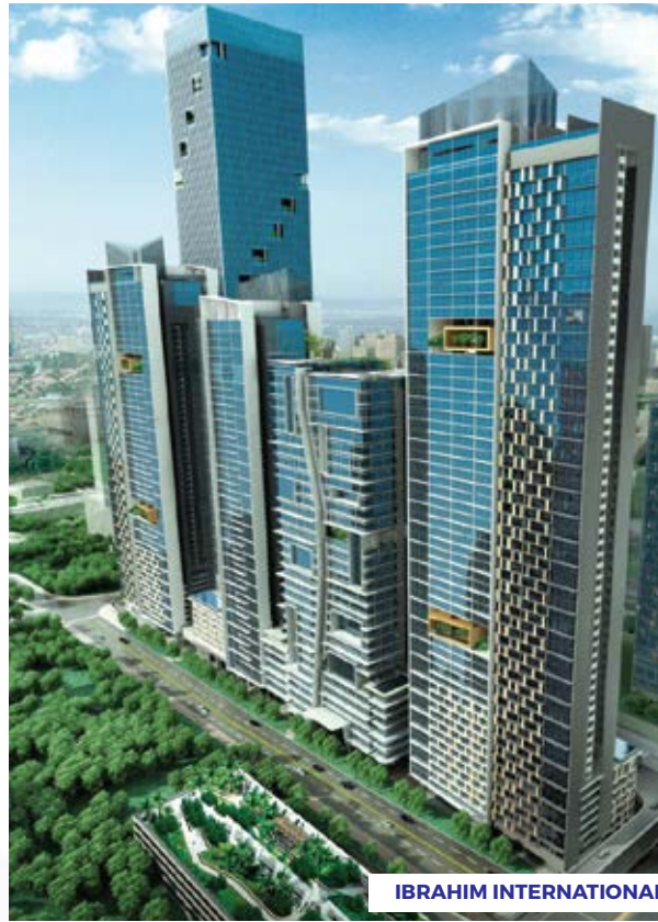
IBRAHIM INTERNATIONAL BUSINESS DISTRICT (IIBD)

This mission will be a new drive to realise the ultimate mission of Johor Yang Berkemajuan.