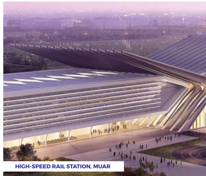
HIGH-SPEED RAIL STATION, MUAR